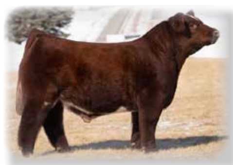
F.S.F. Written In Red Maternal Sib Owned by Wade Rodgers