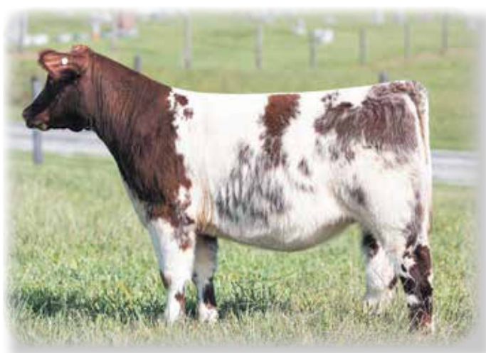
This daughter topped our 2021 Sale with half to Showmax at $10,500.