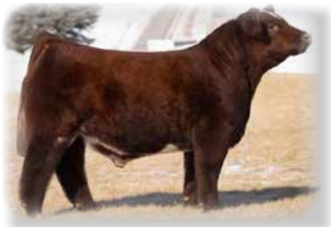
Written in Red