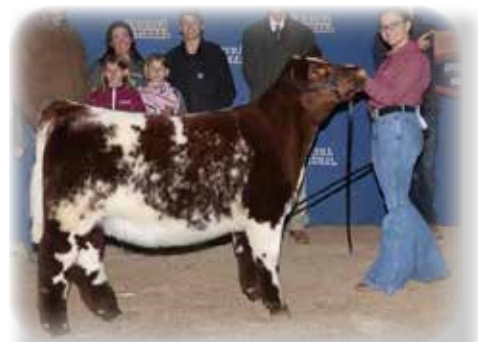
Arizona National Show