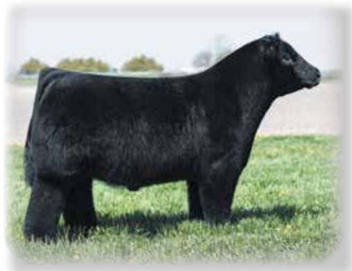
FSF Kolt 45